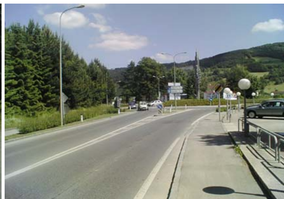
B20 direction Lilienfeld