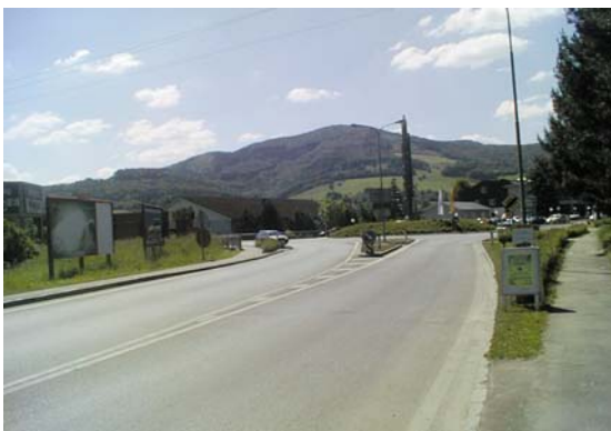
B20 direction Wilhelmsburg