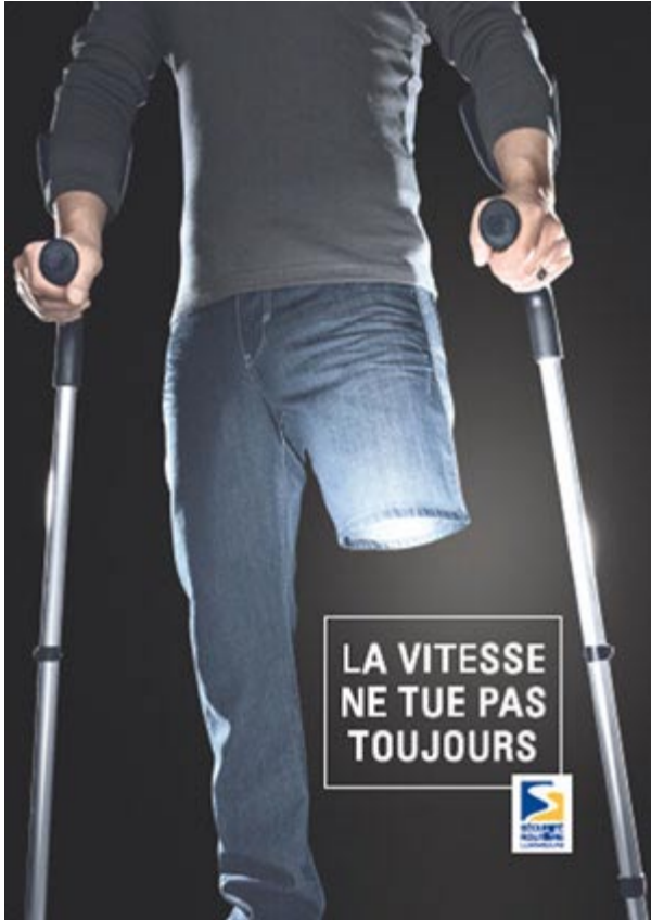
Luxembourg's recent speed awareness campaign