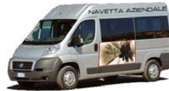
Company Shuttle (Roma Servizi per la Mobilità)

, public administrations (Municipalities/the Ministry of Environment) have set up a scheme to allocate funds and provide support to companies cofunding services of company shuttles. Companies with a Mobility Manager (see section below on national initiatives, the experience of Rome) can submit applications for the cofunding of shuttles: this includes the reimbursement of up to 50% of the total costs of management for a period of two/three years. There is also the possibility for a group of employers located in the same area to submit a project to obtain cofunding for a shared service.