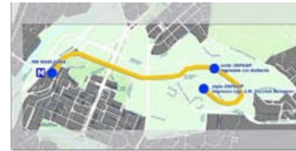
Project of shuttle cofunded by the Municipality of Rome

The establishment of a home to office Commuting Plan is also one of the Mobility Managers’ main tasks. The mobility of employees is first surveyed through questionnaires asking information about both their present commuting mode of transport used, and their availability to adopt more intelligent commuting habits if a number of measures/tools/incentives are made available. A commuting plan is then drafted, including notably the company’s best practices and fostering the use of public transport or its integration with the private car. Appointed Mobility Managers often lack some of the specific technical skills needed for their role, and are therefore guided by a public figure appointed in their region: the Area Mobility Manager. Area Mobility Managers assist all the Mobility Managers and Companies with advisory activities and technical support. The Interaction between Area Mobility Managers and Mobility Managers include: