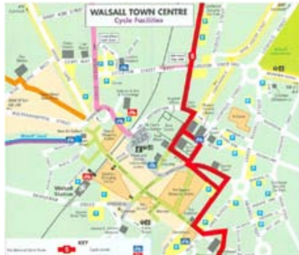
Example of a map for Cyclists to plan a safe route to work (NBTN)

four of the UK workforce. This is a business-to-business network which enables companies to share best practice and promote the rationale for travel plans. Through research and practical case studies, NBTN is developing and demonstrating the strong business case for workplace travel planning. It organises regular meetings to explore relevant issues in travel planning and has developed free information and guidance for employers on topics including tax and travel plans, motorcycling, cycling, walking. They have also developed practical tools to develop personalised access maps for site location and access for pedestrians and cyclists. This is part of the Cycle to Work Guarantee website 15 .