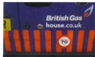
British Gas has specified that all its new vans will be fitted with speed limiters set at 70 mph

has positively influenced both road safety and fuel consumption, reducing the potential for drivers to be involved in high-speed incidents. All vans now display a 70 mph maximum speed sticker on the rear doors to advise other road users. With their level of buying power, Centrica has now forced a number of high profile vehicle manufacturers to offer speed limitation as a standard option, contributing to wider road safety in the community.