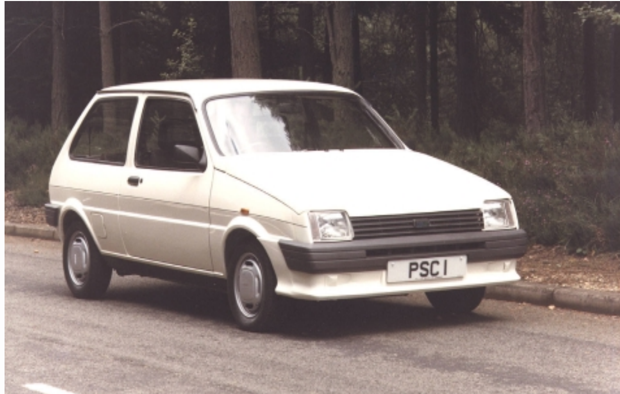
ESV 1985 - Demonstration Pedestrian Safety Car

“... neither ACEA nor EEVC performed a feasibility study...”